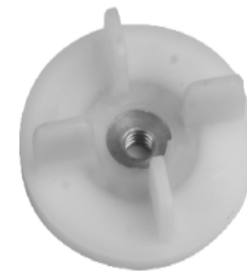
New Jar coupler